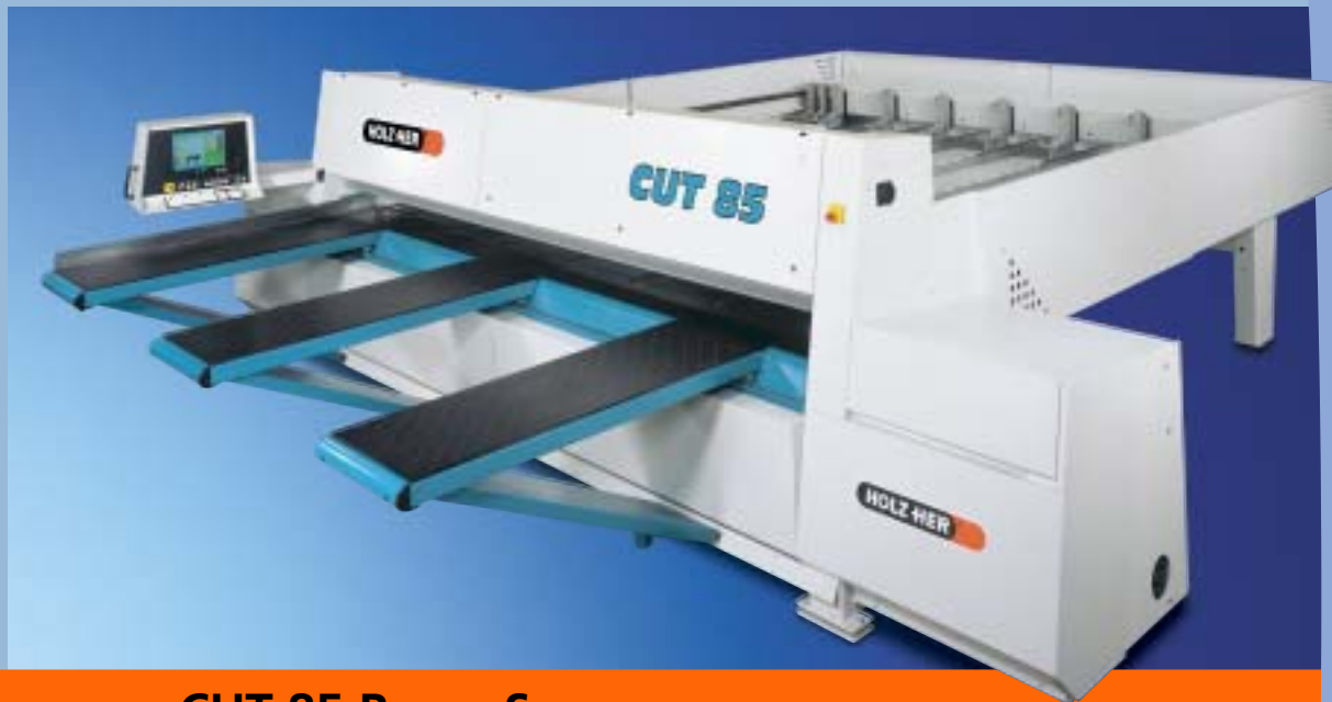
CUT 85 Beam Saw